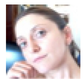
Promotion - Gadget